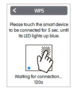
Operate smart device